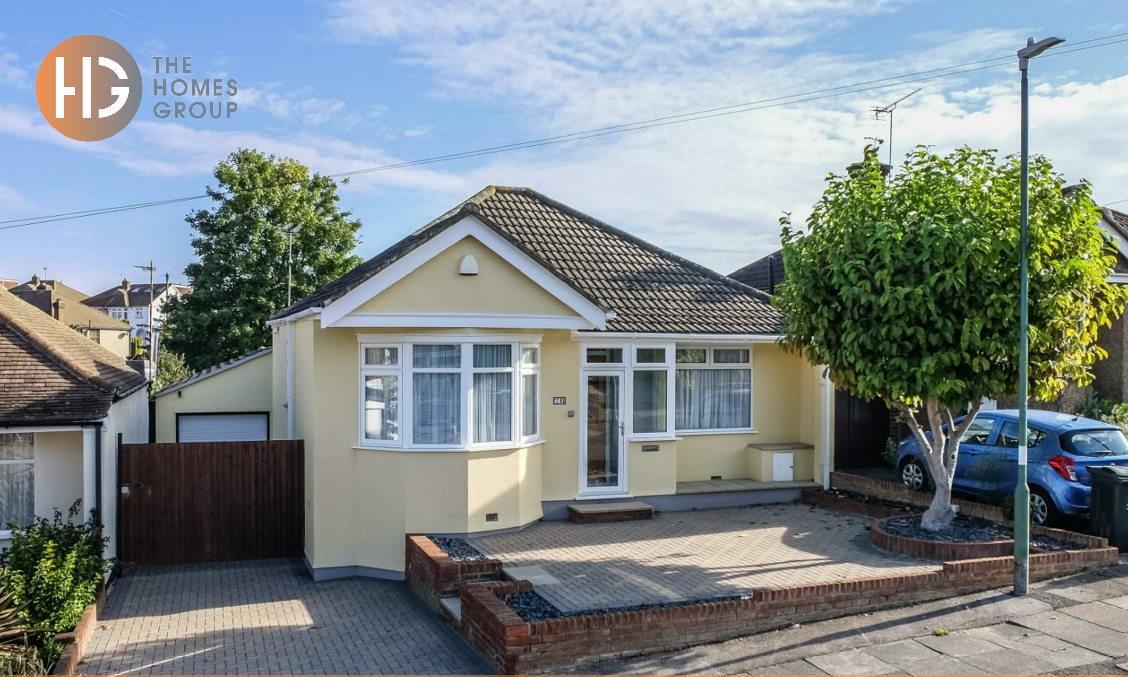
Windsor Drive, Dartford, DA1 3HW Guide price £600,000 - £650,000 Freehold